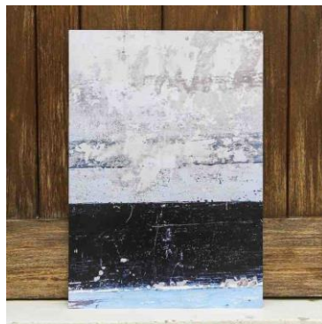
20”H x 14”W