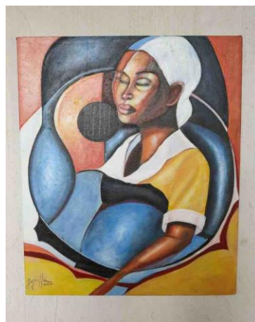
29"H x 24"W