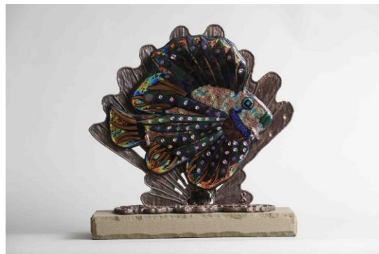
22"H x 22"W