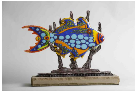
24"H x 26"W