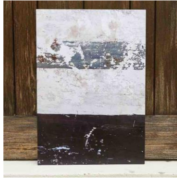
20”H x 14”W

7c “Bequia Hut” - Photograph by Christopher Penn