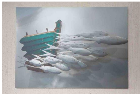
14"H x 20"W

This photograph, printed on a DiBond aluminum panel with frame, is of a wall sculpture by Max Tannahill. Originally from Northern Ireland, Tannahill travelled to Australia where exposure to the work of aboriginal artists left a deep and lasting impression. After returning to England, and while living in the Essex coastal village of Wivenhoe, Max started carving his unique fish from the plentiful supply of driftwood gleaned from the shoreline and estuaries nearby. Utilizing old boat material such as old paint and copper roves, the years of boat-building skills are all embodied in the pieces of his work, which has been developing over nearly thirty years. The original wall sculpture in this photo sold at a recent London Art Fair for over £5000.