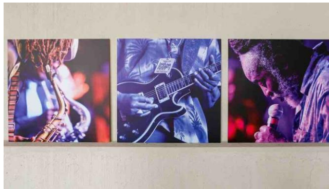
20"H x 20"W each image