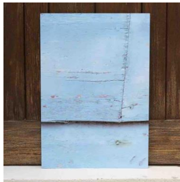
20”H x 14”W

8. “La Familia” – Acrylic on canvas Artist – Calvert Jones