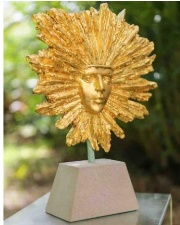
18"H x 13"W

When not travelling and exhibiting globally, Tim Fargher works from his base in Suffolk, UK. His works specialize in oil paintings, watercolors and sculpture and can be found in galleries and collections throughout the world. The Mask of Apollo is one of several series of his mask sculptures, and is a gold leaf covered (gilded) cast bronze mounted on a sandstone plinth. What makes this particular sculpture unusual is that it is gilded with 3 microns of 23 carat gold, the most used gold for this purpose as it is 95.33% gold and is mixed with small amounts of copper and silver to produce subtle differences in colour